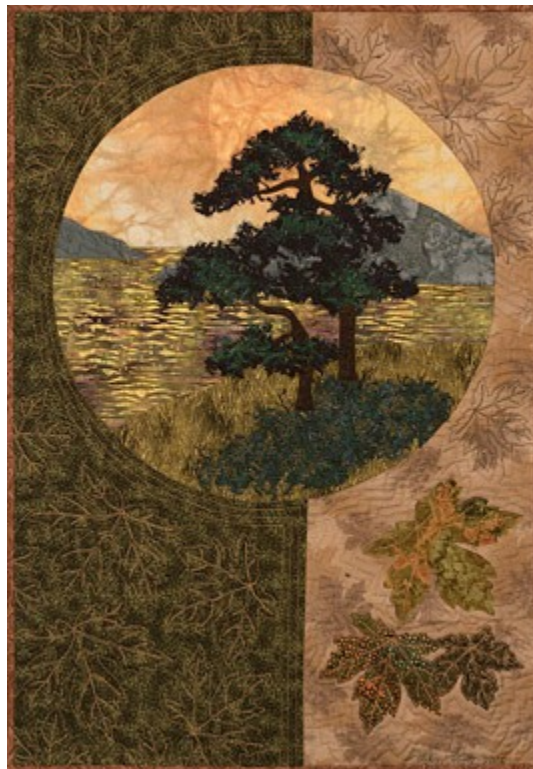
Sample shown has been rendered with confetti

*Note: These two elements are very effective when created with the confetti technique if you are familiar with it. If you choose to do so, 8" squares of batiks in 2-3 appropriate colors instead of the tree and bush fabrics are adequate.